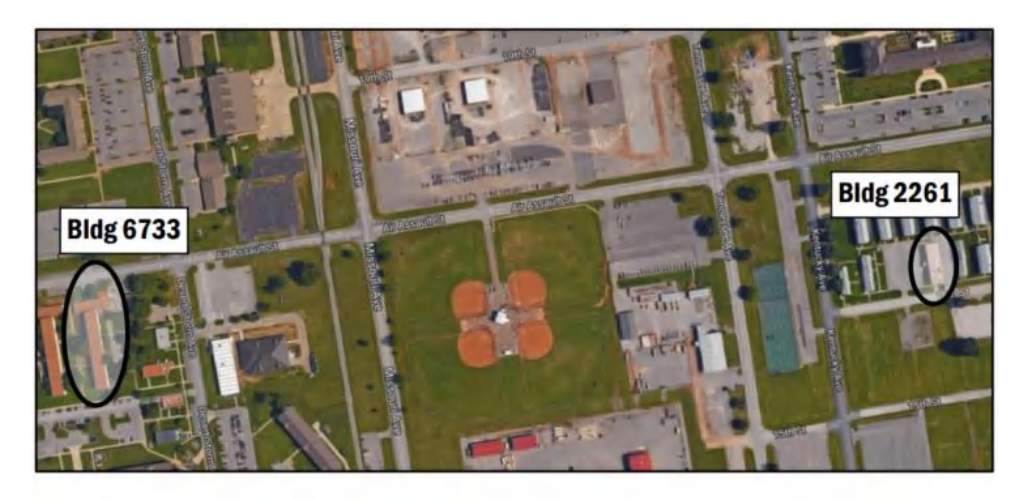
Figure 2. Fort Campbell cantonment area showing demonstration locations.

The Two-step novel dry fog process used exclusively by Pure Maintenance was applied in two buildings at Fort Campbell, KY Army Base in 2017.